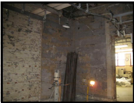
Interior walls in the carcass cooler on the second floor. Both freezers were removed in preparation for installing a large carcass cooler module and a freezer along the east wall.