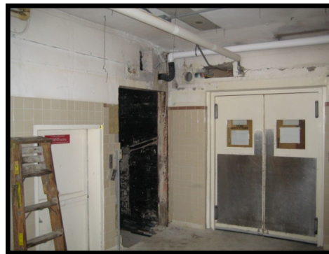
Progress toward decommissioning the meat curing cooler on the first floor and converting it into a dry storage room.